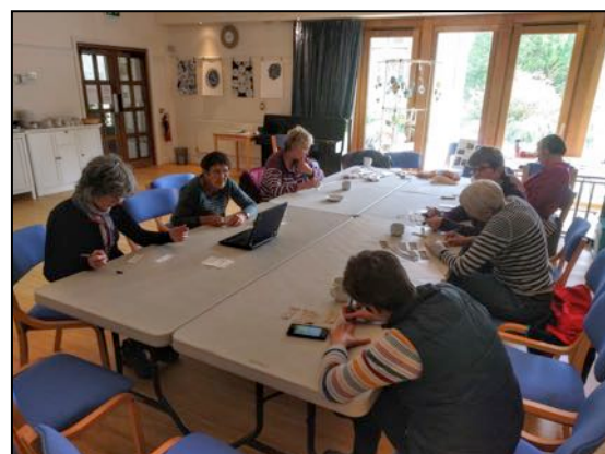
Friends from Lancaster Local Meeting at Swarthmoor Hall (Ulverston, Cumbria)