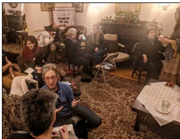
At Beacon Hill Friends House, Boston