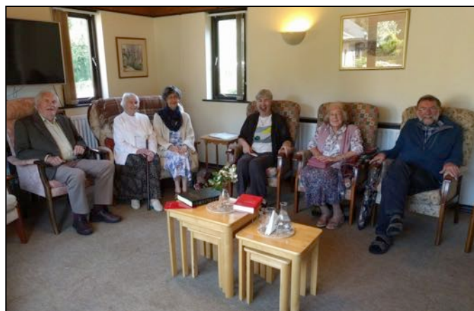
A few Friends after First Day worship with Windermere Local Meeting (Cumbria) at Gatesfield, a Quaker residential community.