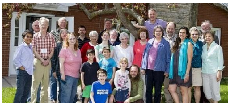
K A L A M A Z O Oh, what a group!

Kalamazoo Friends have been enjoying Friendly Gatherings, an updated take on Friendly Eights. We gather at the Meeting House two evenings each month with members of the Pastoral Care Committee hosting. A brief period of socializing and snacks is followed by a discussion on a spiritual topic. Last year we used a deck of conversation cards on Love, Forgiveness, and Compassion, published by the Fetzer Institute, for our topics. This year we've been watching QuakerSpeak videos and sharing our thoughts on them. This has been a fun way to get to know one another more deeply and an opportunity to integrate newcomers into the Meeting community.