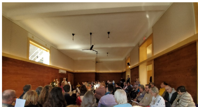
Friends enjoying the Children's Program following the first meeting for worship in our revised space

The Meeting Room has been opened up with three large portals to the transition space, and new windows and glass doors to the outside. A lift and stairway provide access from the new space to the rooms on the first floor of the old building. In back, a large patio and deck provide opportunities for hospitality outdoors during good weather.