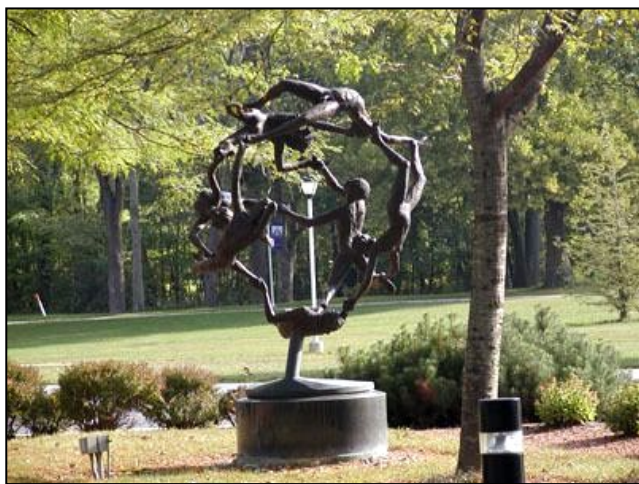
"Constellation Earth," Bluffton Campus