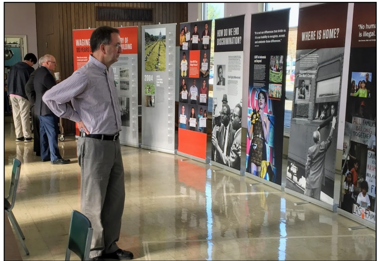
Banner display at First Church in Oberlin

The Banners were set up as a self-explanatory display in five locations over a month-and-a-half: three churches, the Kendal-at-Oberlin hallways, and the Public Library. Meaningful conversations happened as Friends were present at each of these, broadening an awareness of Quakers for the larger Oberlin community. We had opportunity to point to AFSC's receipt of the Nobel Peace Prize in 1947 for work "based on the belief in the worth of every person and faith in the power of love to overcome violence and injustice." All in all, a picture of AFSC was conveyed that not only was historical but also educated about vital work to meet present challenges.