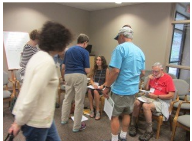
Workshop Scene 2