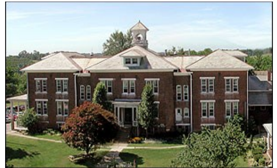
Olney School in Barnesville, OH

It is my pleasure to inform you of the recent events and achievements happening at Olney Friends School. Of significant importance is that Olney has now been USDA-certified as an organic farm and campus. This complements the ever-growing farm-to-table program that allows the Olney community to grow and consume much of its own food. Olney has also renewed its accreditation through ISACS (Independent Schools Association of the Central States). The new project-based curriculum has been implemented and allows for highly individualized learning, leading students to take a greater responsibility in taking initiative for their personal education.