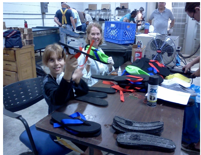
Happy hands at work

The intergenerational group experienced similar realizations and lessons. We were trained in making sandals and doormats by people whose life experiences were totally foreign to us, we were jolted by the simple accommodations and meals, we laughed and worshipped together morning and evening, and fell into bed tired to the bone. This year's theme for our annual sessions of "Breaking Barriers and Building Bridges" was fitting to our experience, as we experienced both barriers and bridges in our short but spirit-filled time in Detroit with CCSS.