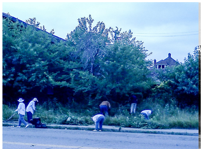
Street Cleaning by the LEYM work crew