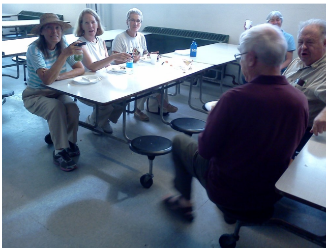
Lunch Break at the Workcamp