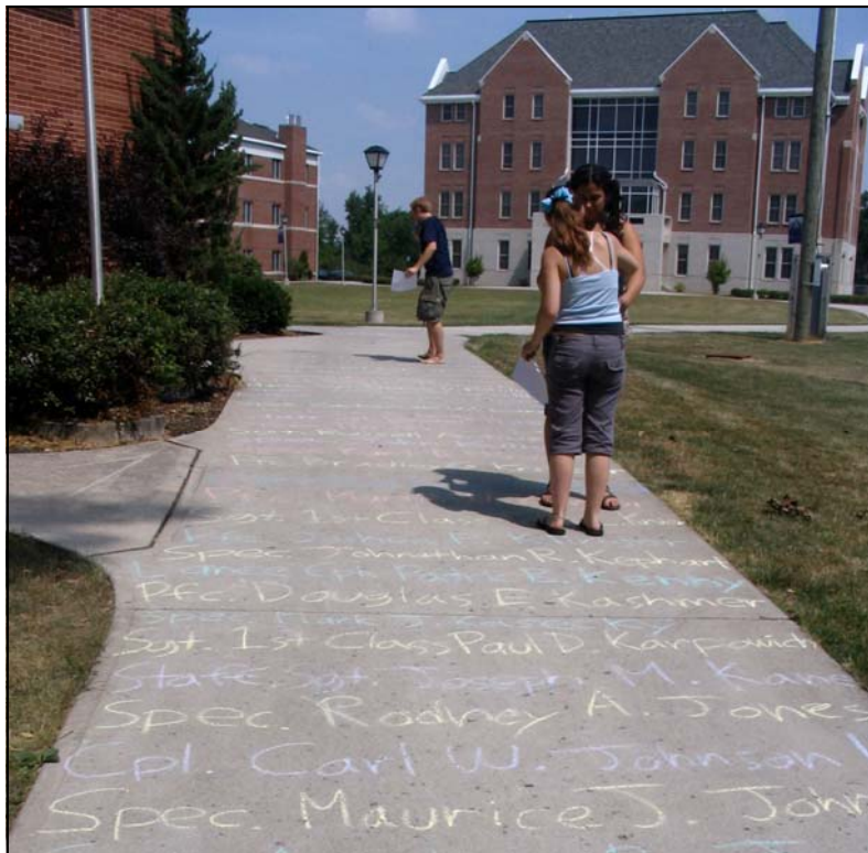
Adult Young Friends and the High School Group transformed the sidewalks for a vigil of remembrance