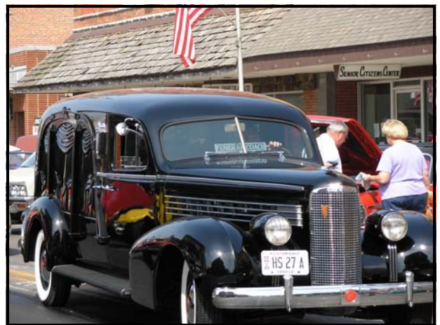
Alternative entertainment in downtown Bluffton

Travel 5,500.00 Office 300.00 Publications 3,400.00 FGC 4,500.00 FGC – Special Program 500.00 Records Project 100.00 Advancement 130.00 Ministry & Nurture 200.00 Spiritual Formation* 600.00 Clerk's Fund 500.00 FWCC Travel* 1,240.00 Friends School in Detroit 2,500.00 High School Youth Fund* 5,400.00 Youth Activity Fund* 2,700.00 Olney Friends School 600.00 TOTALS $ 28,170.00