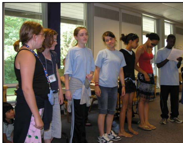
Middle Schoolers (Epistle reading)