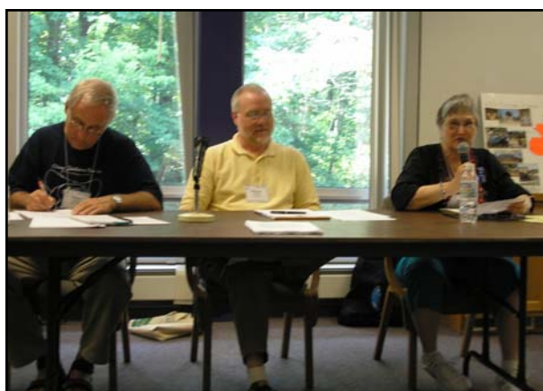
Clerks: Recording, Presiding & Assistant