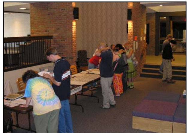
A record 169 Friends registered