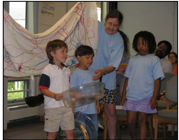
Future FGC Reps? The Early El Group