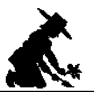
Tending the garden . . .