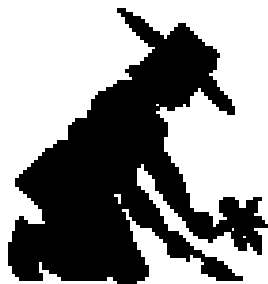
Tending the garden . . .