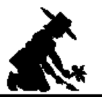
Tending the garden . . .