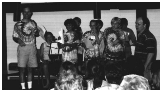
Youth Theater Presentation